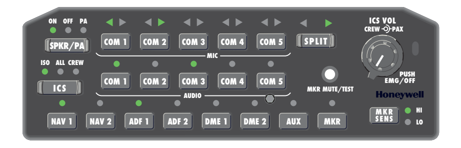
KMA 29 Audio Panel